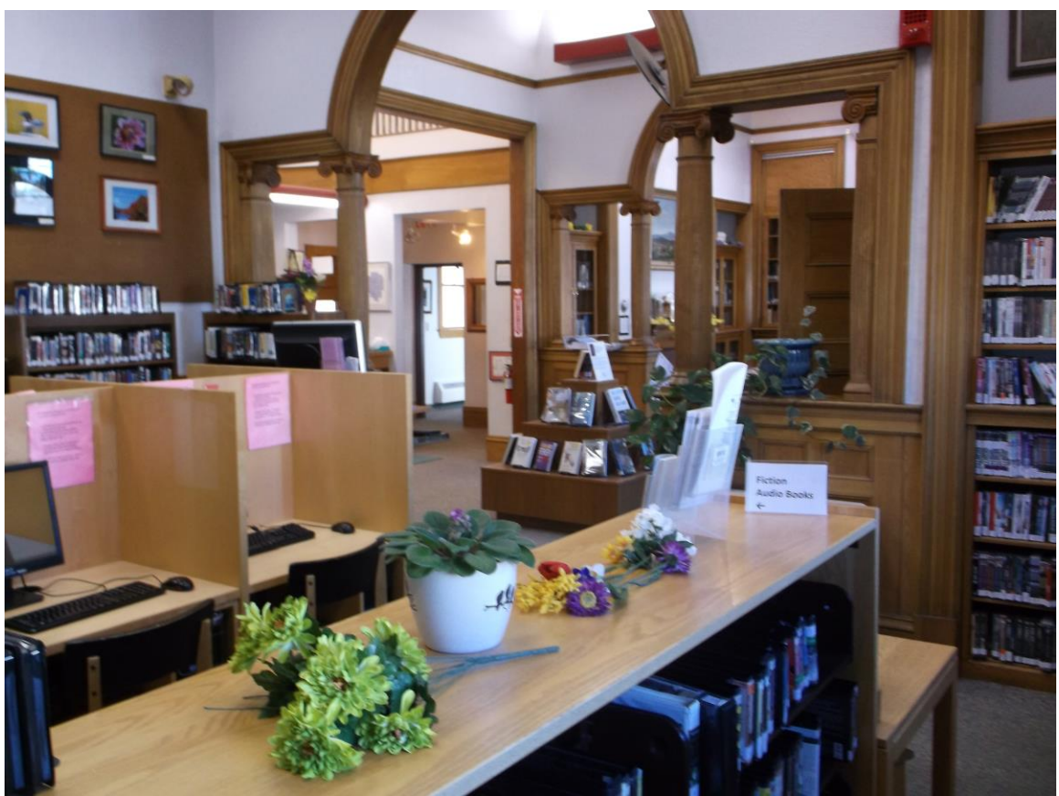
Reading room space retasked for computer workstations and media shelving.

It also appears that the building is not as large as thought. While for a number of years the floor space has been reported as 10,000 square feet, apparently no one can recall how this number was arrived at. Measurements taken for this report and applied generously find only about 7,800 sq. ft. Further, about 36% of that space - a significantly larger amount than usual - is "nonassignable space".