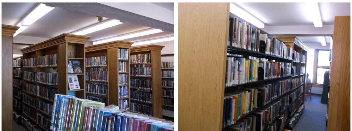
Shelving filled to capacity... and beyond

Overfilled shelves of books and former reference materials space retasked for media.